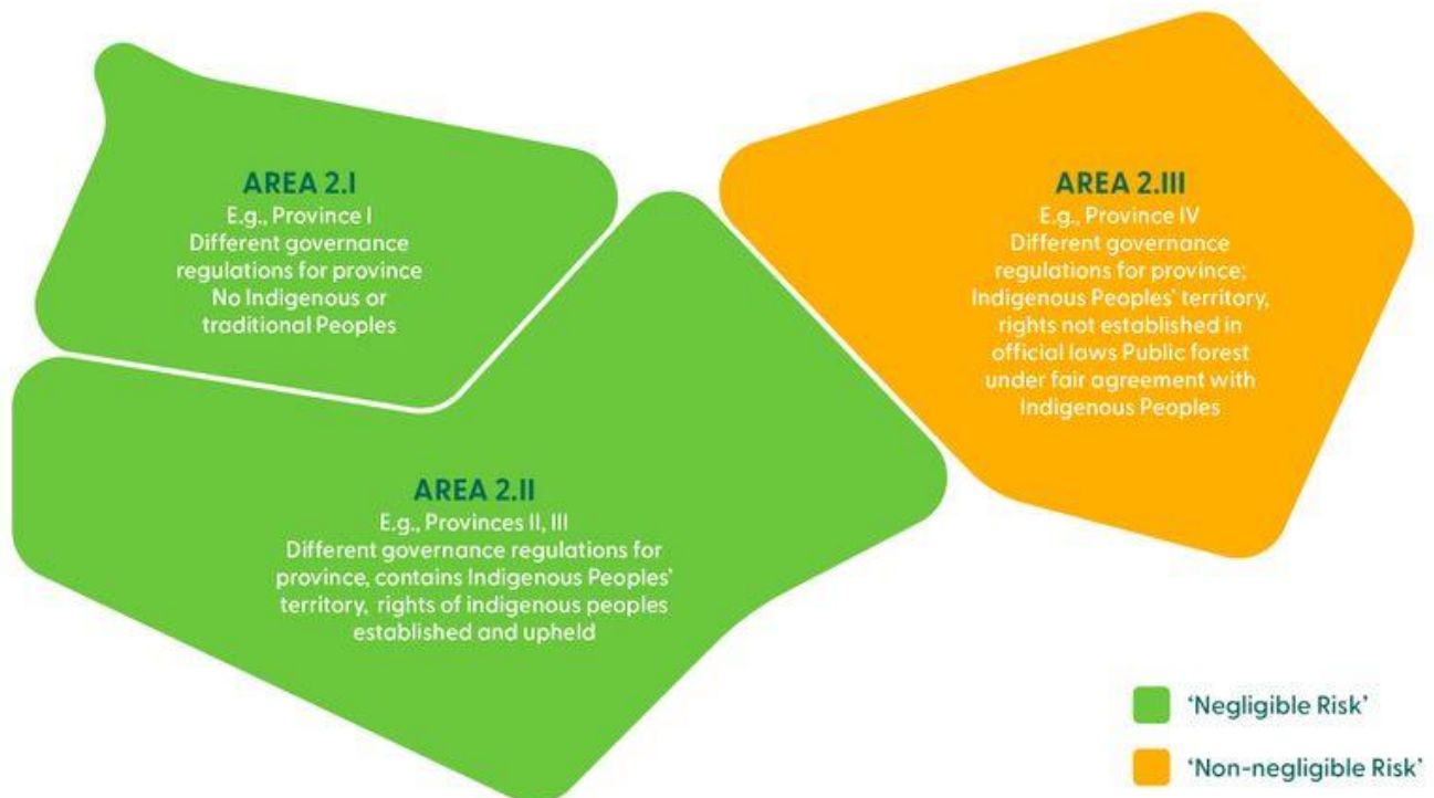
Figure 3. Designation of risks considering geopolitical and functional scales.

Within Province IV, the presence of Indigenous Peoples has been confirmed. The applicable legislation does not cover Indigenous Peoples' rights, and there are no other regulations that would protect the rights of Indigenous Peoples. The mitigation of this risk will require the implementation of FPIC, and evidence of this shall be provided through agreements with the relevant Indigenous Peoples' representatives. In this area, forests are managed by private owners and public authorities. Special agreements have been signed for public forests (PF) between forest managers and Indigenous Peoples' representatives, ensuring the implementation of FPIC. Evidence exists that these agreements are upheld. There is no such agreement signed for private forests. The area is assessed as 'negligible risk' for public forests and as 'non-negligible risk' for other forests.